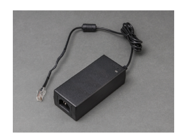
Model 5170D Adapter